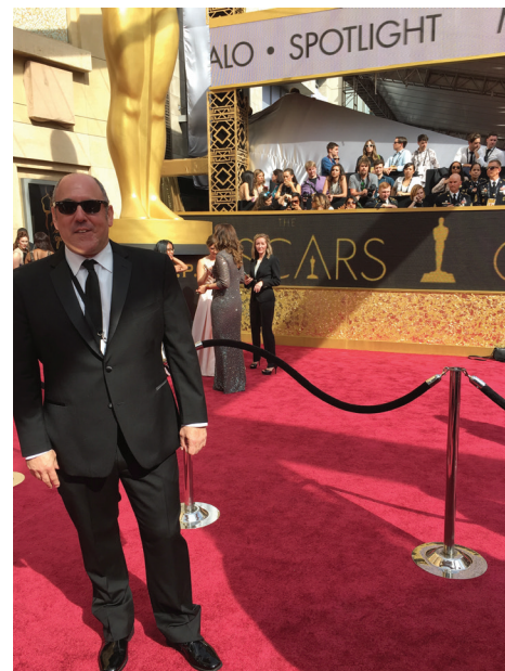
On the red carpet for the 2016 Oscars - not nominated just there to work.

"I recently just celebrated 22 years at Entertainment Weekly magazine, most recently as the Deputy Photography Director, West Coast. For the last 6 years I have been living in Santa Monica, CA after living in NYC."