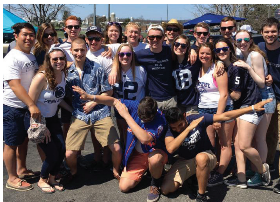
Brothers and friends gather for a tailgate at this year's Blue-White football game.

We are looking for photos past and present! Share them with us to share with other alumni and to have them on file for years to come! All photos are fair game – homecomings, THON, Blue White Weekends, formals, tailgates, reunions, you name it! Send them to alumninews@affinityconnection.com .