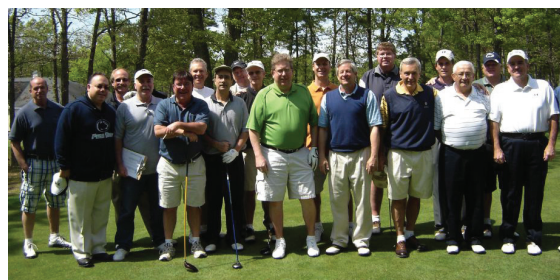
Omega alumni at the 30 th annual Theta Chi Open in 2011.