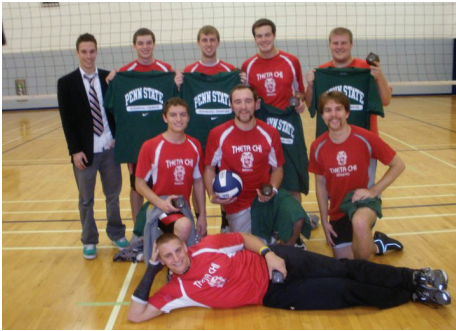
2010 Volleyball champs, 3-time defending champs

Academics - 10 th highest GPA Fall 2010 (3.19 Average) and 12 th highest GPA Spring 2011 (3.22 Average)