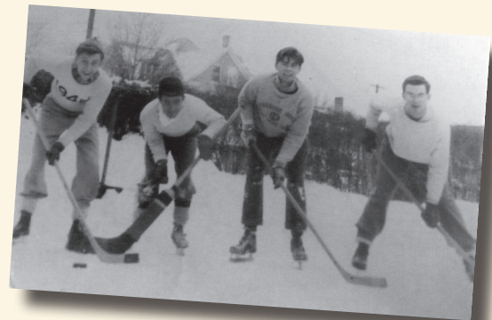
Right: "Omega Hockey Team" in the 1940's.