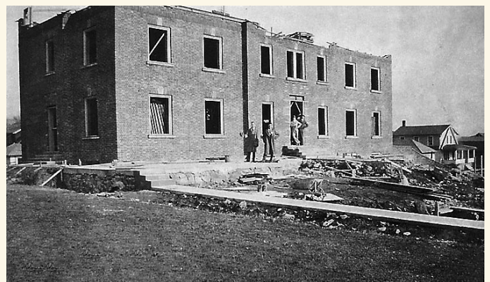
Theta Chi House During Construction

Two Stories built - Pratically complete - Nov. 16, 1929