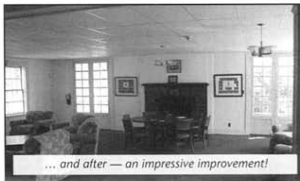
... and after — an impressive improvement!