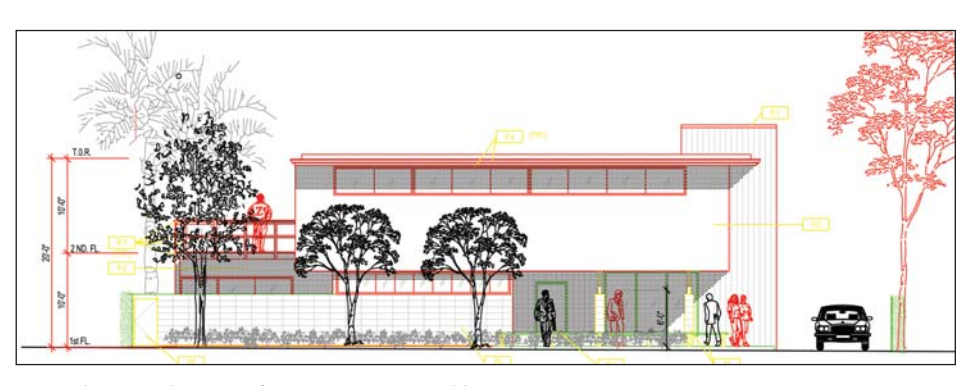
Front elevation drawing of Beta Tau's proposed house.

And just what are those products? "In the bathrooms, we'll have waterless no-flush urinals, low-flow pressure-assist toilets that use from 1 to 1.6 gallons of water per flush, sinks with autoshut off features, showers with water-saving heads, and washroom hand dryers that use air instead of paper towels. Our water will be heated, not by conventional, wasteful gas-fired cylindrical storage tanks, but instead we'll use what's common all over Europe—tankless water heaters. Water is heated on demand, eliminating the constant heat/cool cycle of regular storage tanks."