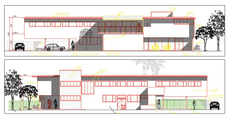
TOP: Side elevation. ABOVE: Elevation showing back of Beta Tau's proposed energy-efficient house.

The finale will be the installation of solar panels on the roof. "We couldn't have asked for a more perfect location or design of the house. The mid-century home has a flat roof and the property is perfectly aligned to capture the sun's path across the sky. No trees block the area, so we'll be in constant sunlight." Solar power in southern California is a trend that is catching on, thanks to major incentives from power companies. Regulations mandate that the companies have to buy back any surplus wattage produced by the solar array. Cook goes on to explain, "We'll receive up to 80 percent of the