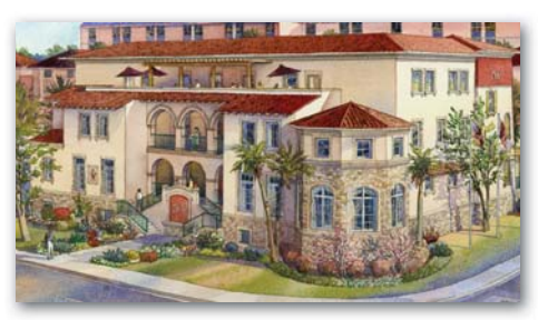
Gamma Theta/SDSU is still in the fundraising stage, but hopes to break ground on this beautiful new house in 2009.

The outside of the Xi Chapter House has been "tagged" by UVA secret societies to indicate that a Theta Chi has been selected to become a member of their organization. Inside the house is a real-life replica of the badge—two swords crossed over a real taxidermied rattlesnake.