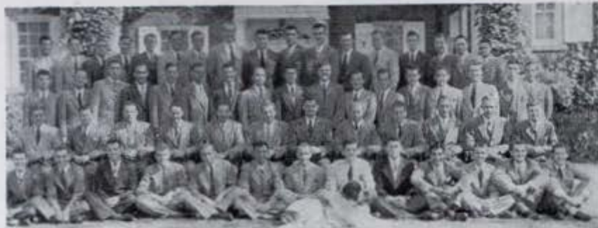
Rho Chapter, University of Illinois, 1946-47 Back to Normal