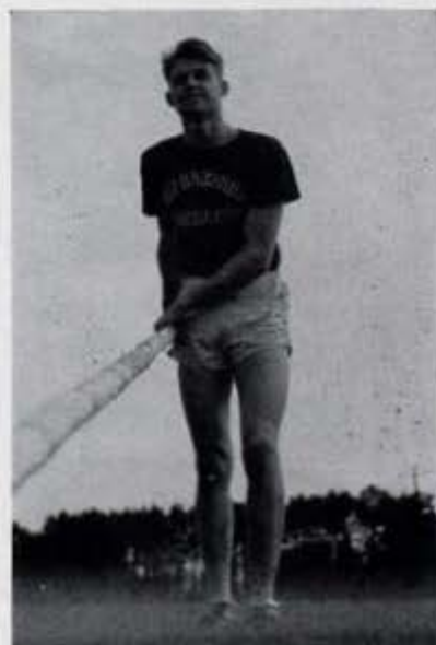
Champion Richmond Marcom