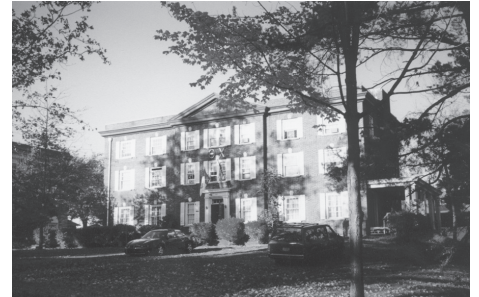
The house at 523 S. Allen St. could be back under Omega Chapter ownership in just a few short months.