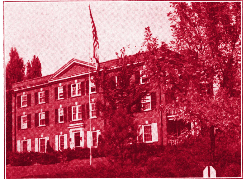
Our Present Home